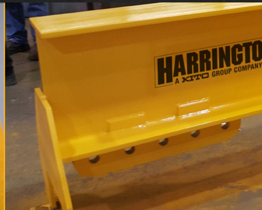
Parent Metal Design