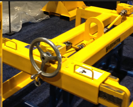
Heavy Duty Drives

PROOF TESTED TO 125% CAPACITY WITH CERTIFICATE SUPPLIED